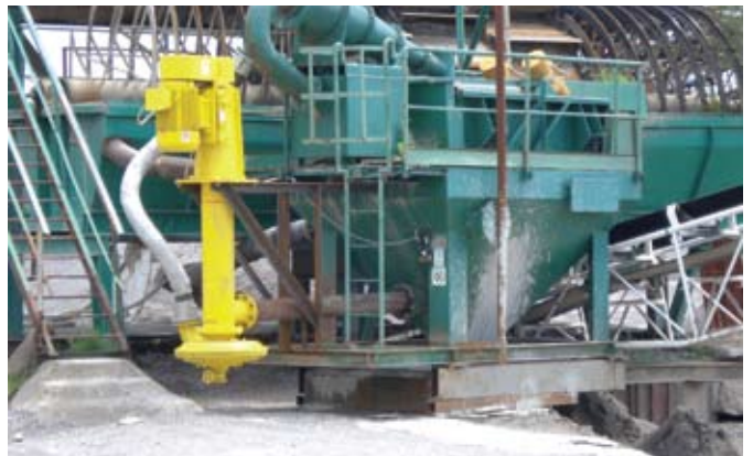
AUS PEMO pump for Hydrocyclone feed application