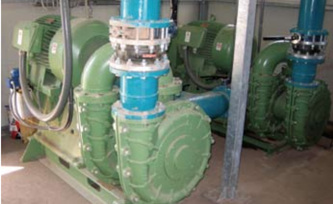
Horizontal double stage PEMO pumps for filter press