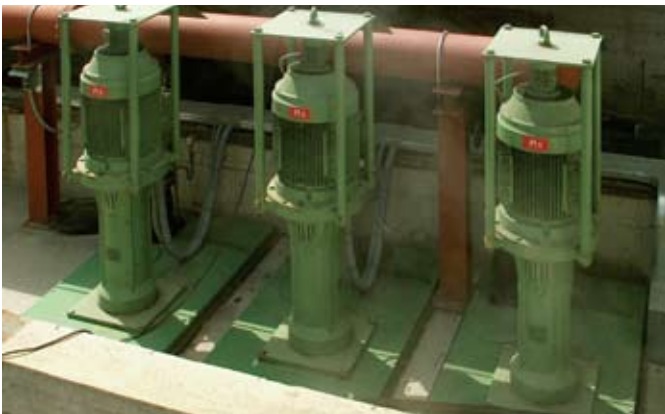
Vertical PEMO pumps for transfer of slurries