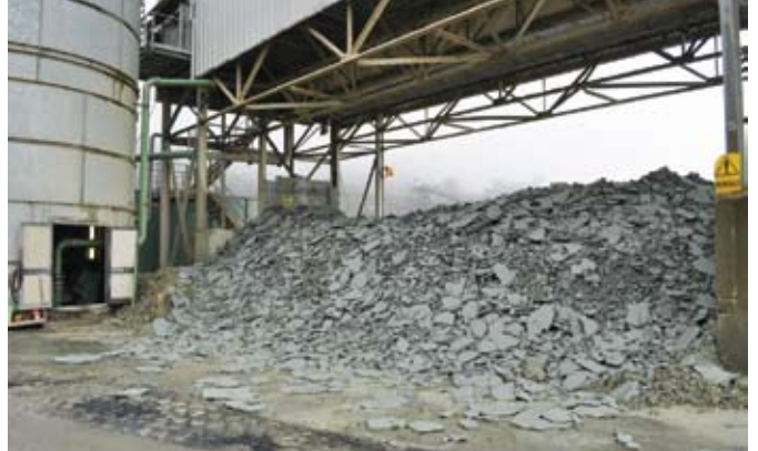
Concentrated slurries by PEMO pumps in 2 x 2 meters filter press